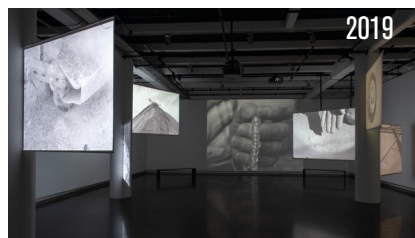
Yasmine Benabderrahmane, installation view - La Bête, un conte moderne . 2020 © ADAGP, Paris, 2021